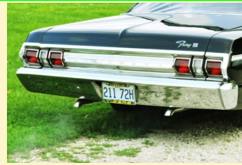
RENE'S 1965 FURY

Cowtown Mopar Performance Club Meeting on 02/15/2026