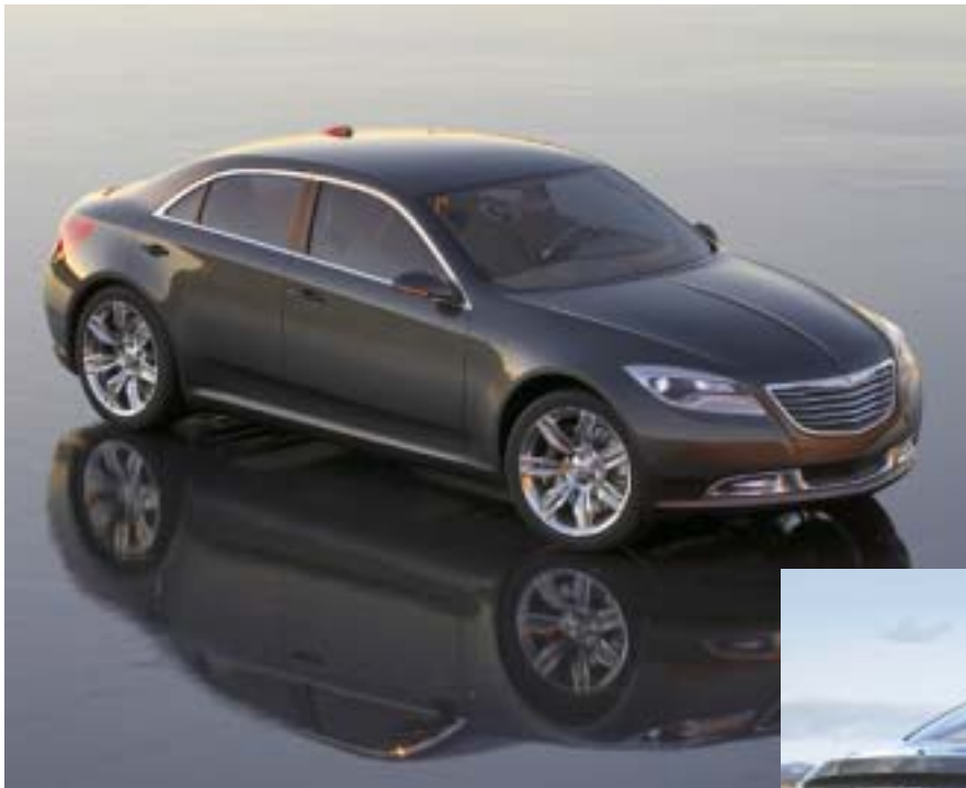
Chrysler 200C Concept Car

Go to https://community.chryslerlistens.com/app and click on "Not A Member".